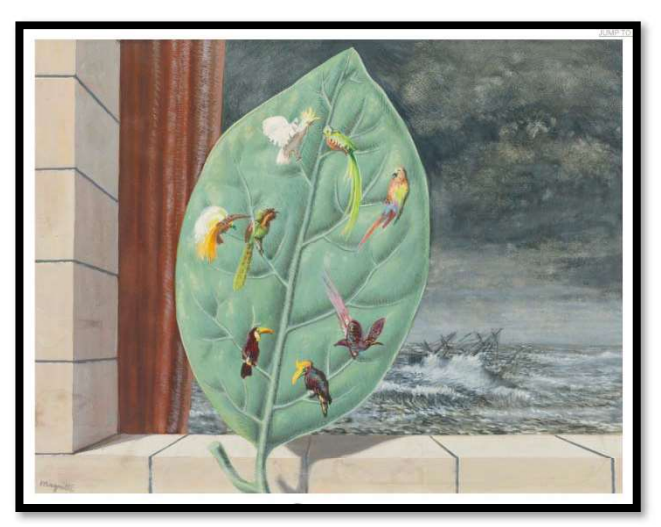
René Magritte's Le Rendez-Vous

Origin of funds used for purchase. On November 13, 2012, Highland Business wired $903,180.11 from its account at Societe General to Steamort's Tallinn Business Bank account. The wire transfer instructions noted: "according to finder agreement." On the same day, Steamort wired $869,000 from its Tallinn Business Bank to Sotheby's New York account at JPMorgan Chase. The wire transfer noted it was "for subjects of interior."