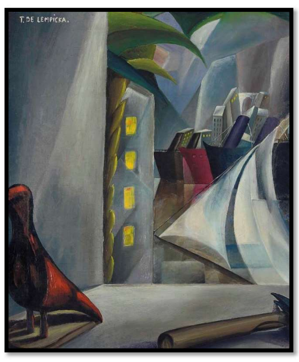
Tamara De Lempicka's Un Port Sous La Lune

Shipment. Art Courier managed the shipment of Un port sous la lune by Dietl to the Hasenkamp art storage facility in Germany.<sup>963</sup>