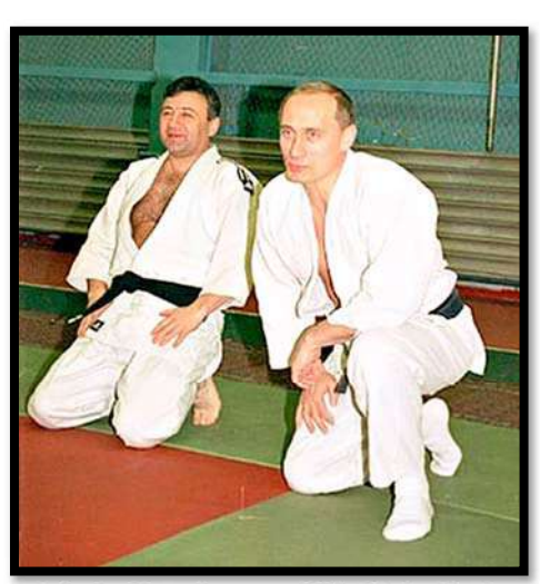
Arkady Rotenberg and Vladimir Putin