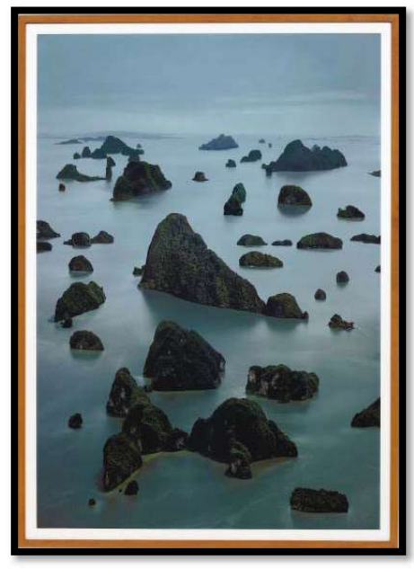
Andreas Gursky's James Bond Island I

On December 1, 2014, Steamort wired $725,000 and $329,000 from its Tallinn Business Bank account in two separate wires to Phillips' account at Citibank.<sup>978</sup> The wire transfer instructions noted the payment was for "payment by invoice...for subject of interior."<sup>979</sup> The instructions specifically referenced NY010714, Lot 14 and NY010814, Lot 228.<sup>980</sup>