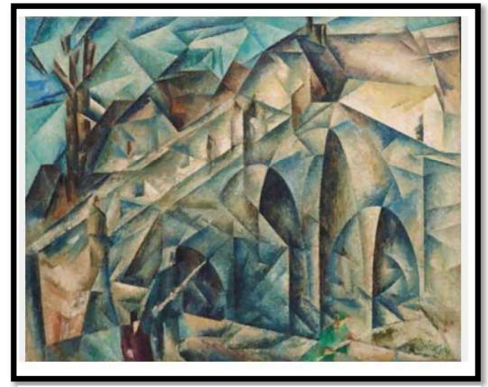
Lyonel Feininger's Brucke II