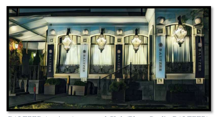
BALTZER Auction Agency and Club