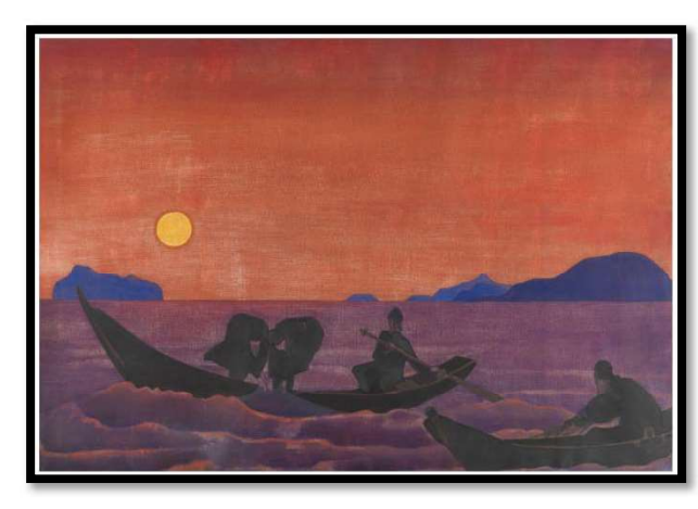
Nicholas Roerich's And We Continue Fishing

Origin of funds used for purchase. On November 16, 2011, Highland Business wired $1,496,862.12 from its account with Societe Generale to Steamort's Tallinn Business Bank