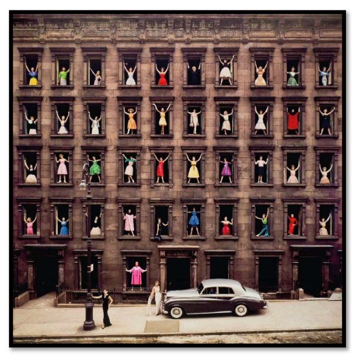
Ormond Gigli's Girls in the Windows, New York City, 1960

Origin of funds used for purchase. On October 6, 2014, Highland Ventures wired $33,312.50 from its Gazprombank account to Steamort's Tallinn Business Bank account.<sup>948</sup> The wire noted "per request DD October 2, 2014 (Ref. Christie's 20/21 Photographs."<sup>949</sup> On October 30, 2014, BALTZER LLP wired