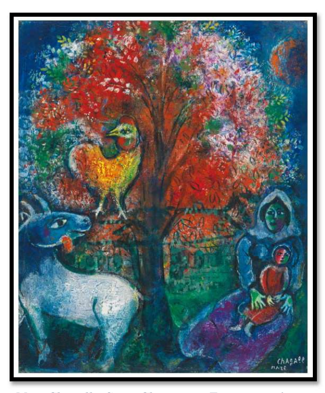
Marc Chagall's Scene Champetre/Femme et enfant